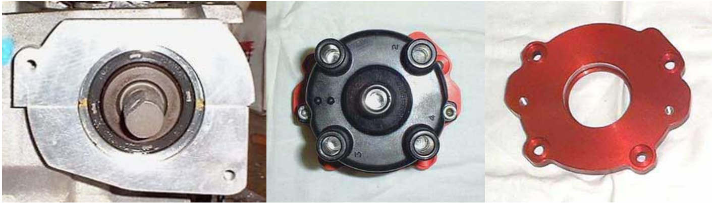
Comparative positions of rotor arm spigot for standard and VVC inlet cams